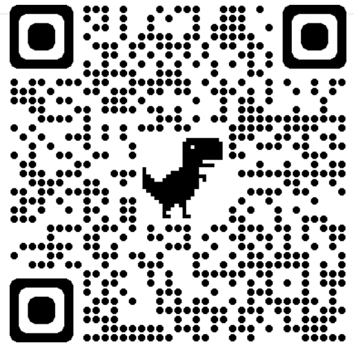
Boaz High School on Twitter